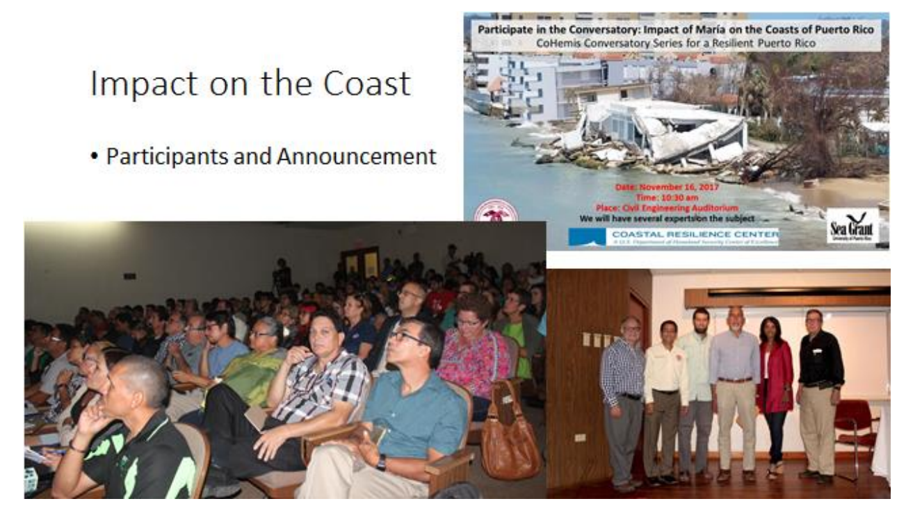
Example of Conversatory.