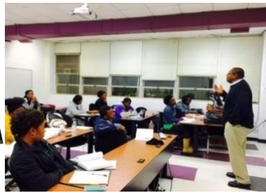
Instructor DCS 320