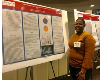
Students participating at MAS