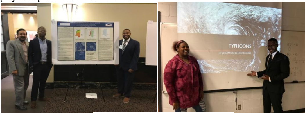
DCS 201 Instructor & Class