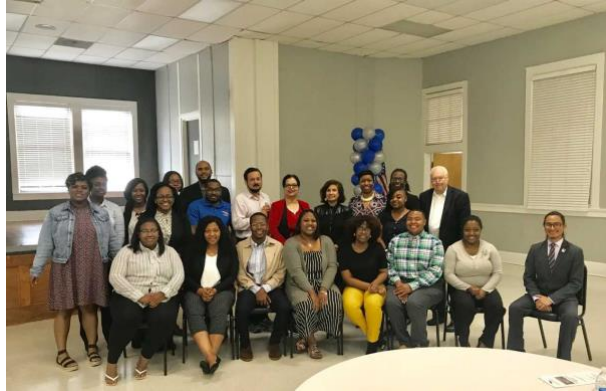
DCS Faculty & Students with